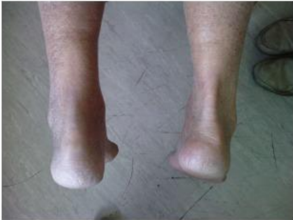
Figure1: View of the right and left Achilles tendon with the patient prone. The left is ruptured. The right Achilles tendon is well defined and soft tissues hang off it like a tent. The suspension of the soft tissues off the Achilles tendon is not visible on the left side as the tendon is ruptured. (10)

The flaw in the Achilles tendon is typically palpable with a level of sensitivity of 0.71 and specificity of 0.89. Maffulli compared the sensitivity and uniqueness of the principal medical tests developed to identify Achilles tendon rupture (12) . Particular tests consist of Simmonds or Thompsons' test with sensitivity of 0.98 and uniqueness of 0.93. Lesser recognized are the O'Brien and Copeland tests both with a sensitivity of 0.8. Early reports suggest that approximately 20% of Achilles tendon injuries can be missed by medical assessment alone (13) .